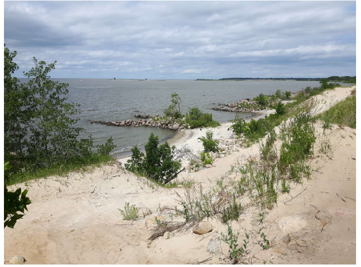
Sandy Beach out front