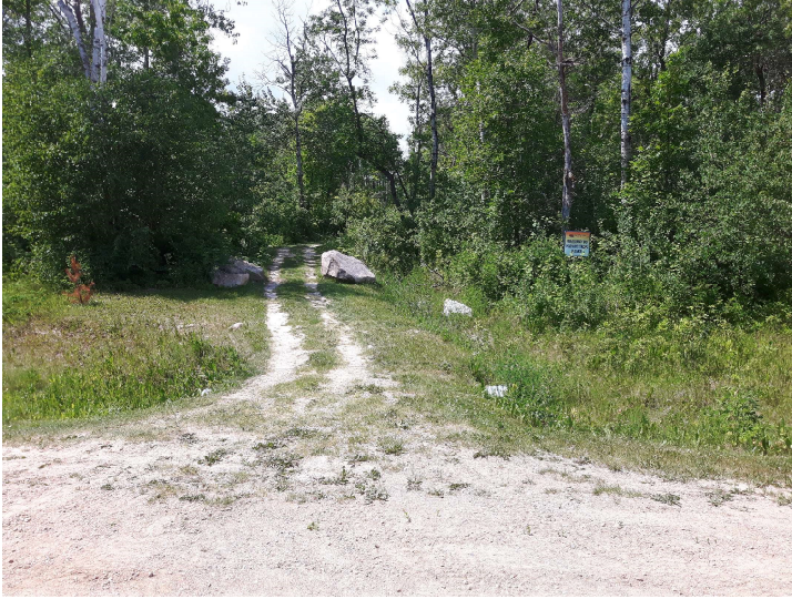
Public Path to the Beach