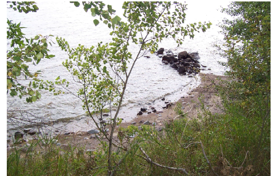
Sandy Beach out front