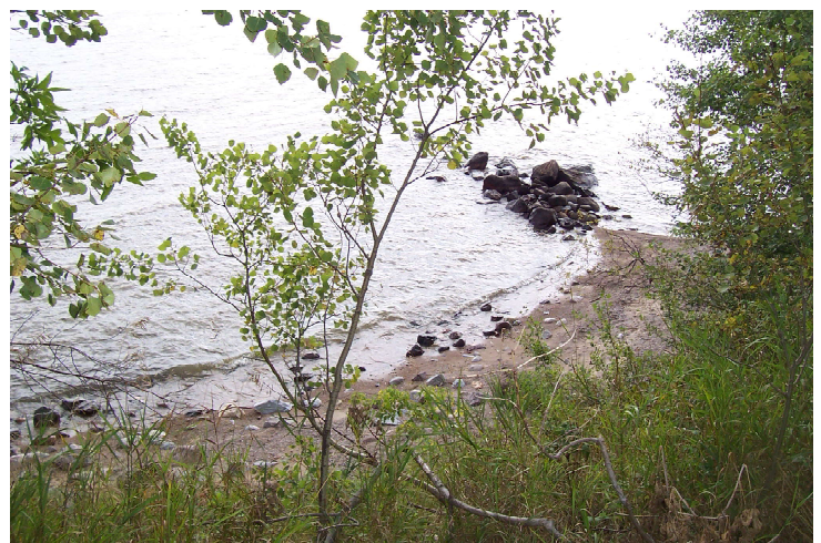
Sandy Beach out front