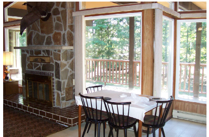
Large Open Plan Kitchen