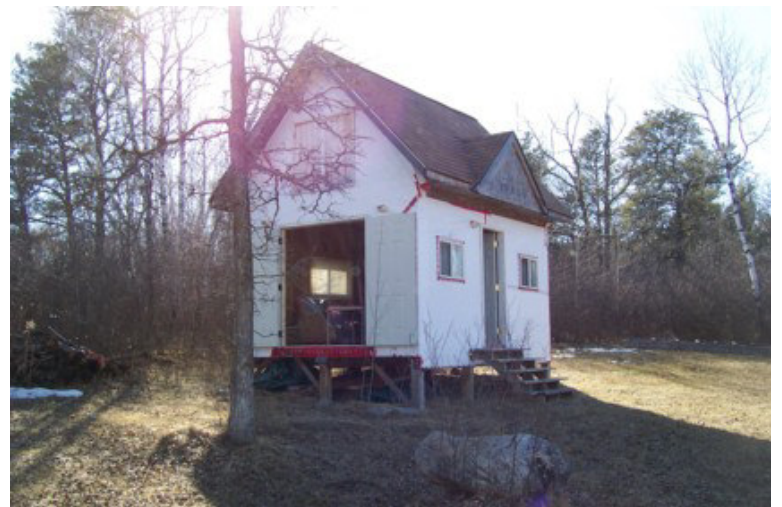
Shed ( 12' x 16')